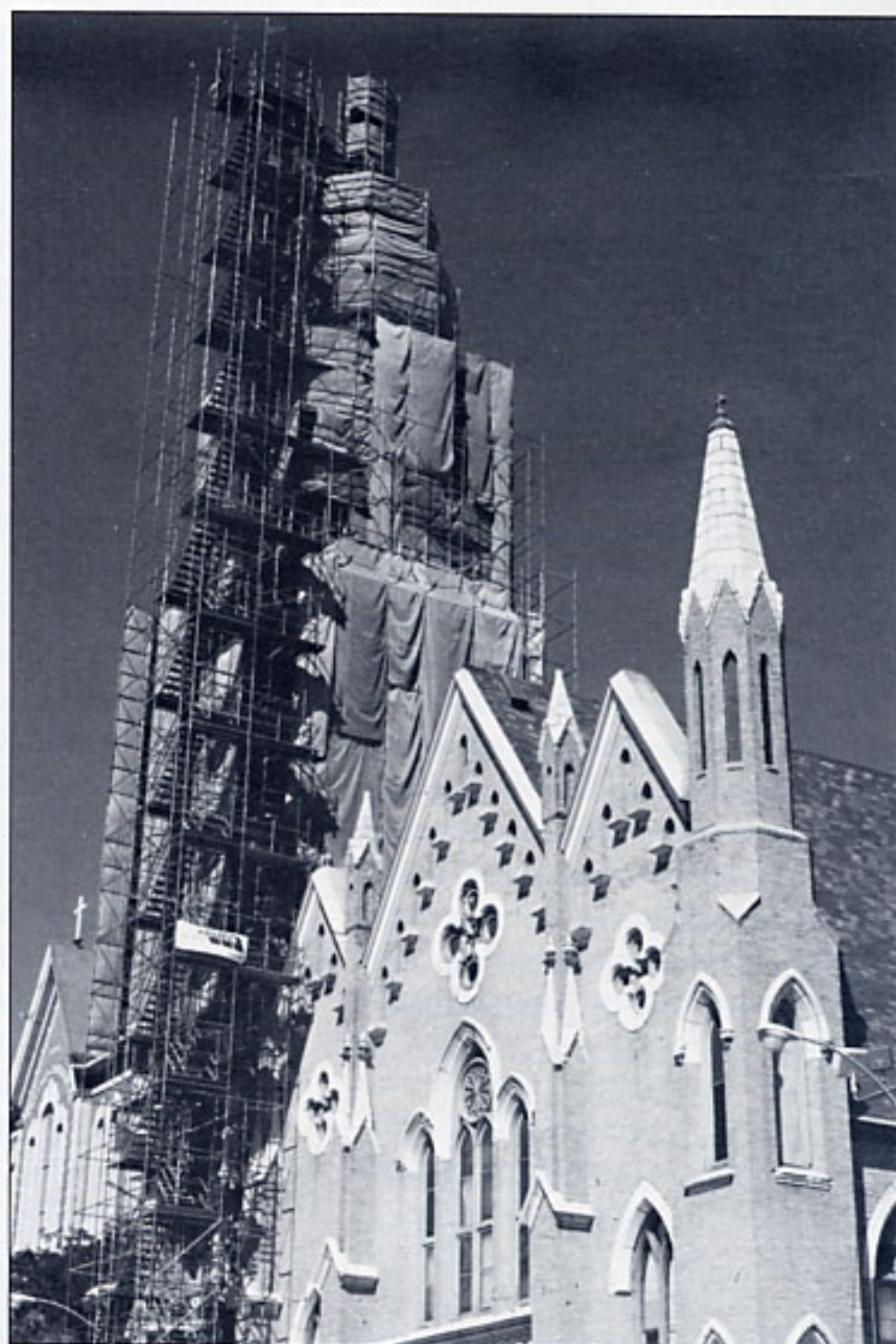
The steeple was wrapped in scaffolding during its restoration in 2001.