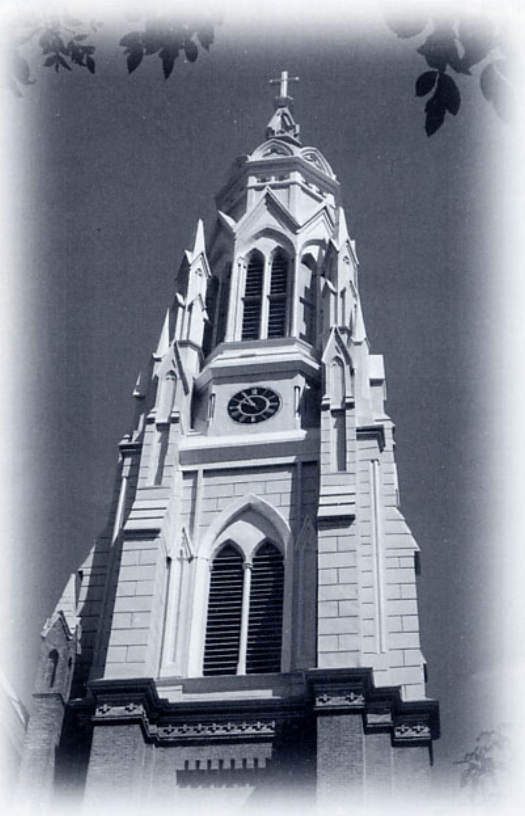
Restoration of the steeple was just one component of a decade-long rehabilitation effort funded by the Holy Family Preservation Society.