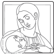
Nativity of Mary